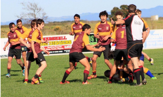
Under 69kg Restricted